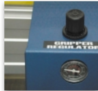
Pneumatic gripper regulator