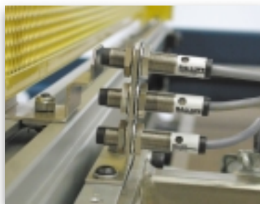
Repositionable start/stop flags